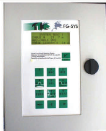
FG-SYS LL, Digital Unit Wall Mounted Width: 200 mm, High: 250 mm, and Deep: 100 mm